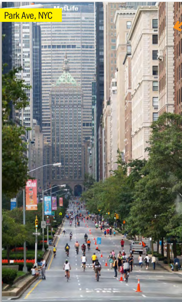
Park Ave, NYC

... they have one in New York and it attracts 300,000+ people